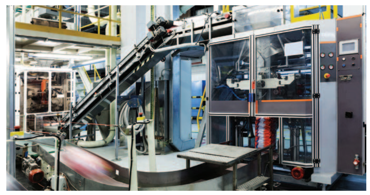
Optimized products for higher production output with less engineering efforts